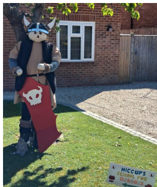
6 York Road

The committee would like to thank everyone who got involved in this event, making it so very special.