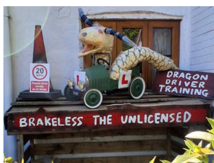
1 Main Street