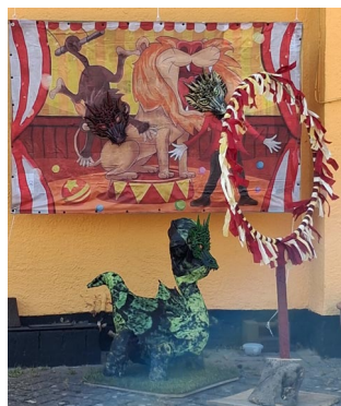
5 Manor Close