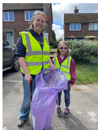
Litter picking volunteers