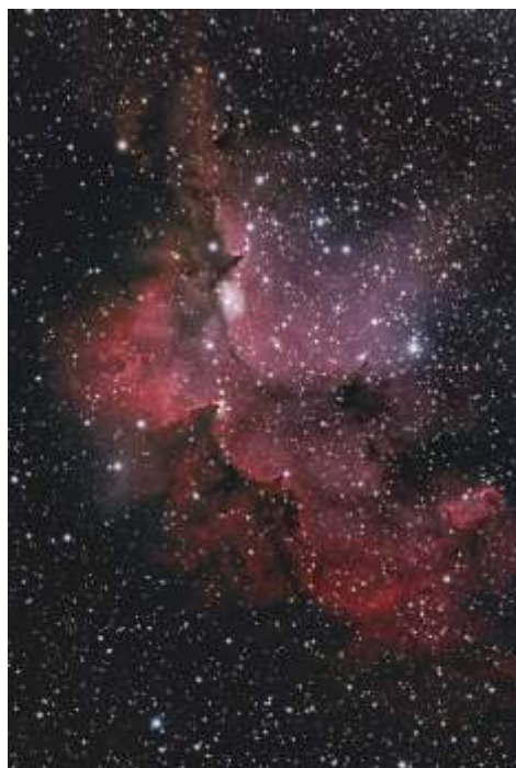
The Wizard nebula