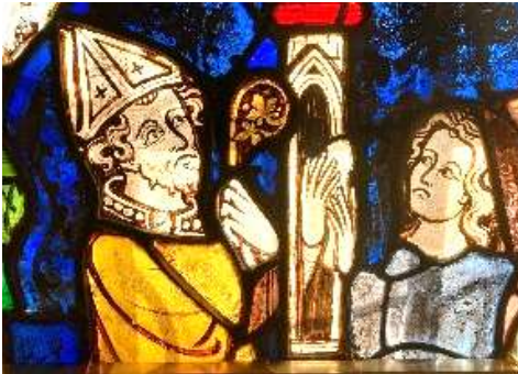
St Nicholas in the Chantry Chapel Window, All Saints' North Moreton.

The United Benefice of Blewbury, East and West Hagbourne and Upton together with Aston Tirrold, Aston Upthorpe, North Moreton and South Moreton.