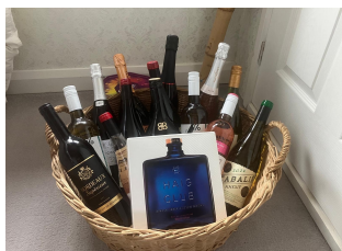
Raffle prize: a magnificent hamper